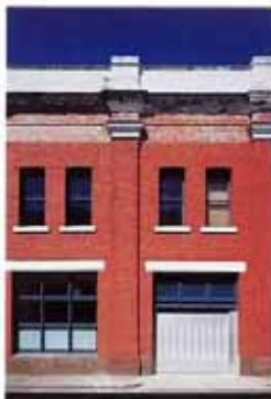
Above: The garage of the warehouse apartment in Collingwood.

Woods Felicity Lewis Photography: Shannon Slater/ Styling: Neil Fosse